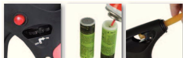
Gas ON/OFF wheel & ignition button