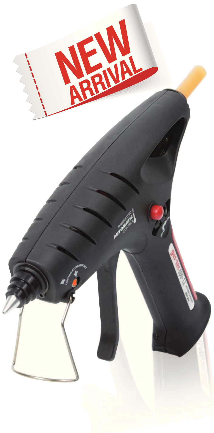
Takes standard 12mm (1/2") glue sticks